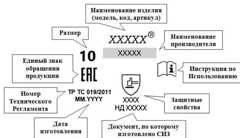
Figure 1. An example of applying marking

28.1.8. The marking (Figure 1) should be legible over the period of using the gloves. It is prohibited to use of gloves without marking.